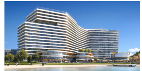
Hospitality & Property